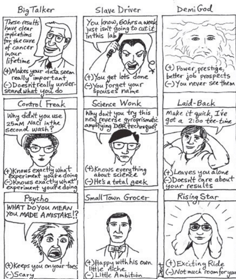
Figure 1: Mentors come in different species.

Most important, you want to choose someone you can get along with since you will be interacting primarily with your mentor.